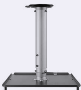
Ceiling Mount: 5JJCY10.001